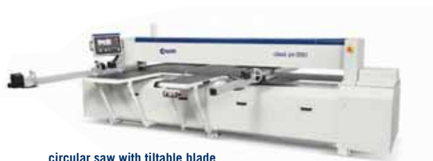
circular saw with tiltable blade