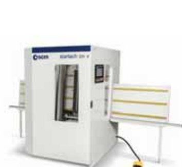
cnc boring machine