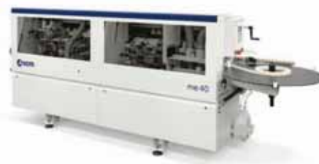
automatic edge bander